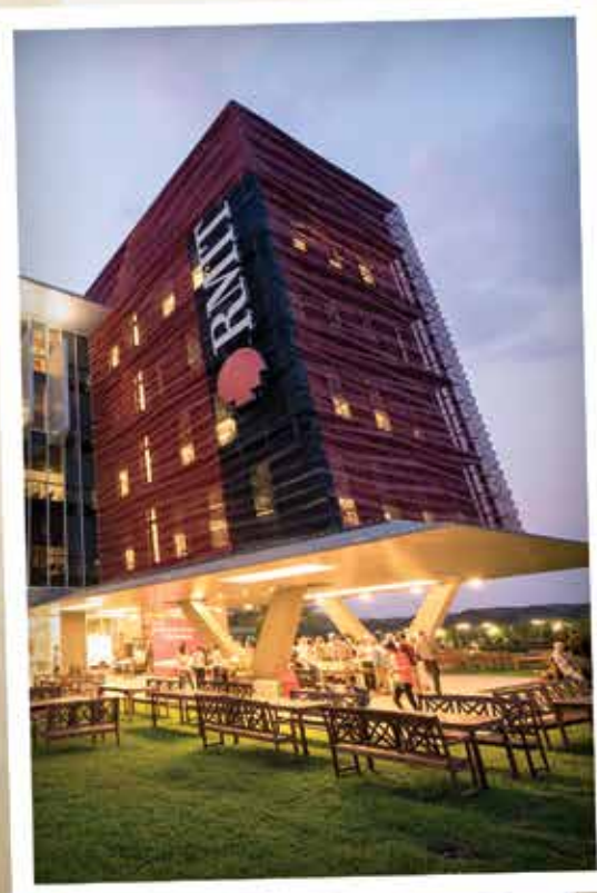
RMIT Vietnam Campus