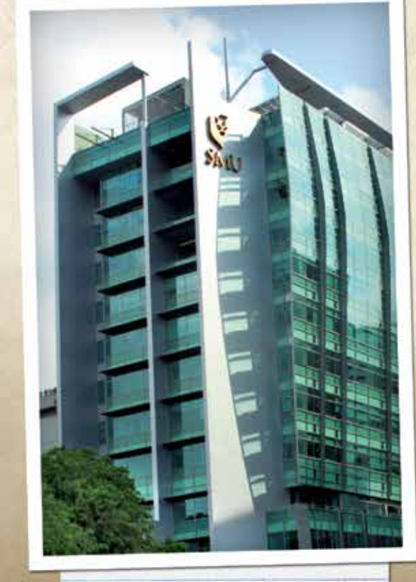
Singapore Management University (SMU) campus

LATE-DECEMBER TO LATE-APRIL MID-AUGUST TO EARLY-DECEMBER